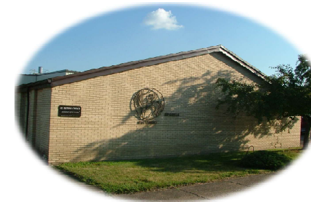
St. Matthias Freeport