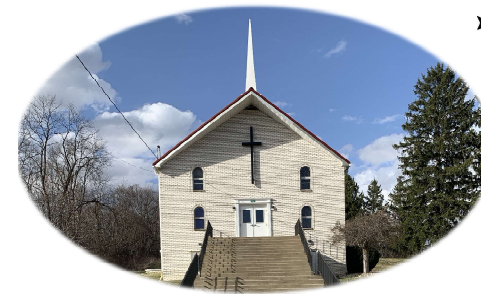
Sacred Heart Church Hopedale