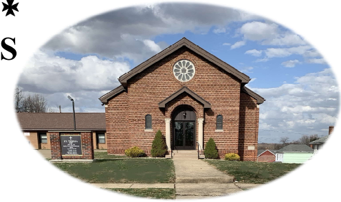
St. Teresa of Avila Cadiz